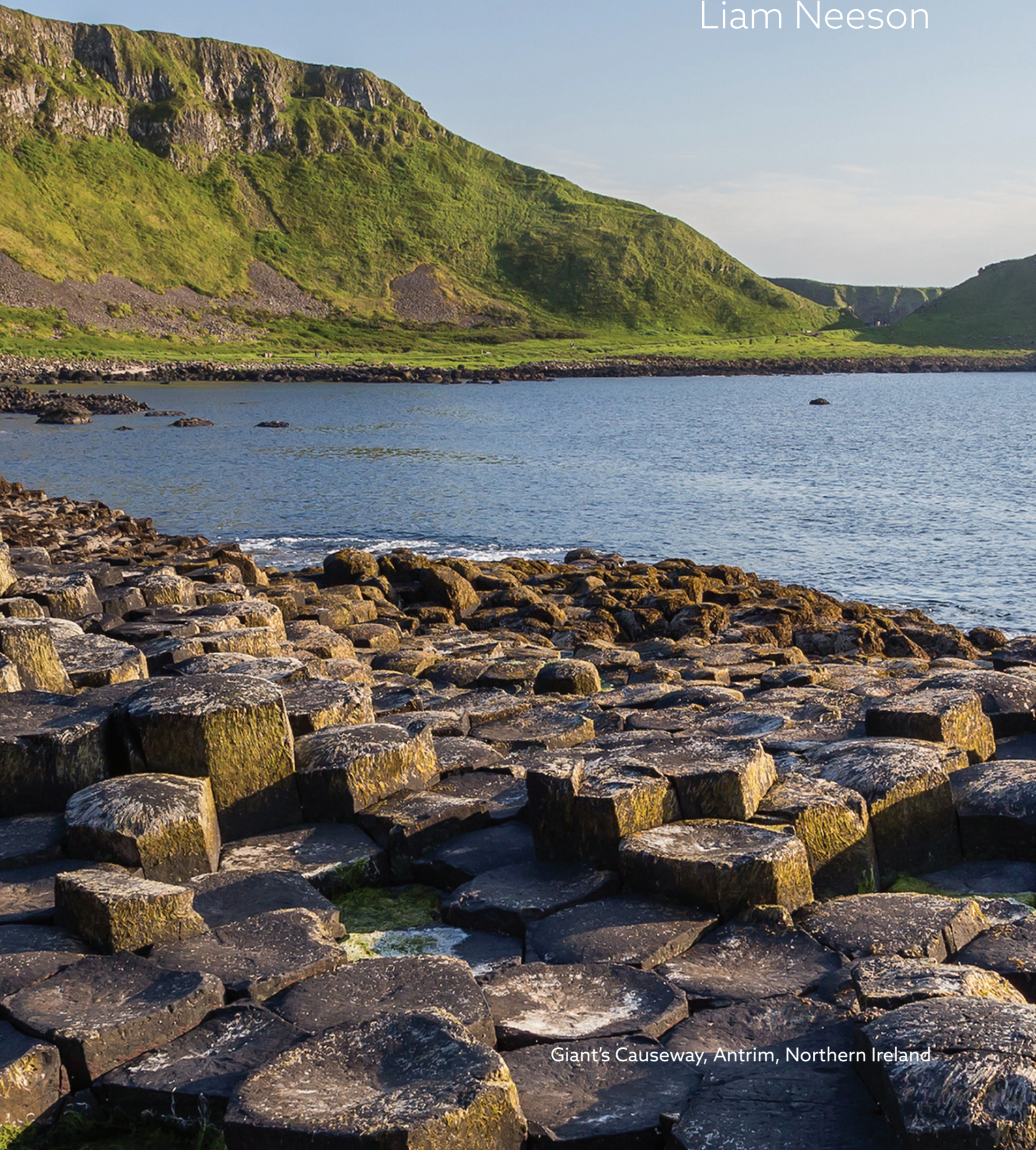
Giant's Causeway, Antrim, Northern Ireland

Northern Ireland is a friendly and sociable country with a lot to offer. In fact, in recent years the Office of National Statistics rated Northern Ireland as the happiest place to live in the UK!