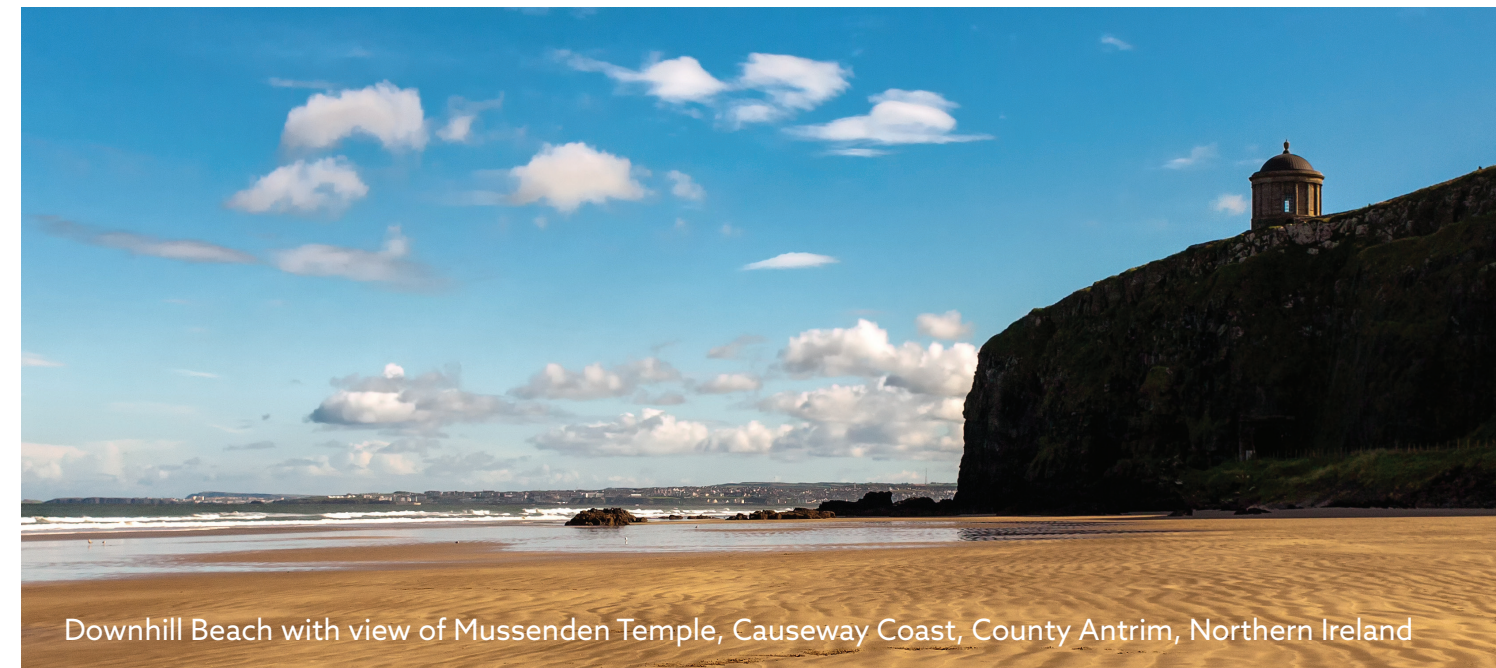
Downhill Beach with view of Mussenden Temple, Causeway Coast, County Antrim, Northern Ireland

Explore the great outdoors and you will find dramatic coastlines, castles, mountains, lakes, some of the best golf courses in the world, superb fishing, water sports, walking trails, scenic drives and historical landmarks.